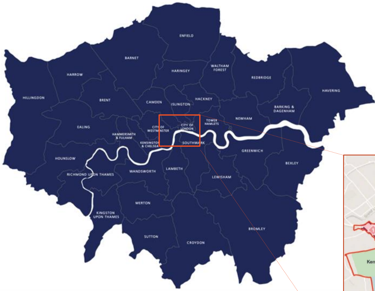
The Central Activities Zone (CAZ)